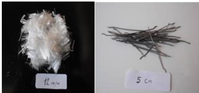
Figure 3. Polypropylene of length 12 mm and Steel Fiber of length 5 cm