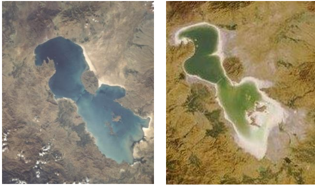
Figure 1: Satellite images of Lake Urmia in the probe and the water has receded

and pollution of the Caspian Sea, examples of inefficient management and environmental problems in the region.