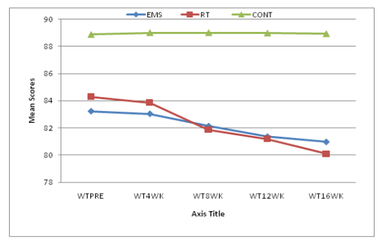
Figure 1- Mean weight scores of EMS. RES and Control groups from pre testing to 16 weeks

Table 2- Mean weight scores of EMS. RES and Control groups from pre testing to 16 weeks