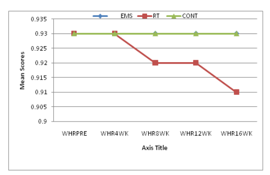
Figure 2- Mean WHR scores of EMS. RT and Control groups from pre testing to 16 weeks