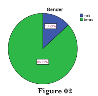
Figure 02 13.3% (n=21) participants were male gender and 86.7% (n=137) participants are female gender