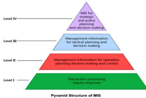
Fig. 1- Pyramid Structure of MIS

MIS plays a very important role in any organization and having very wide scope because Management Information System study whole information about society and individual. To be shown and clarified the way MIS, it can be seen on four different layers as depicted in pyramid structure - figure 1: