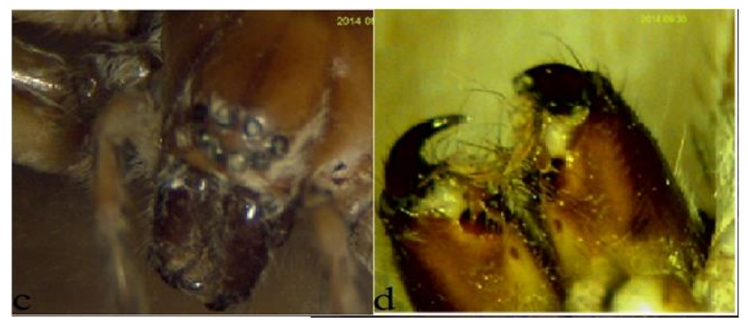
Figure 3. (c-d) c. Eusparassus naheedae eyes d. Cheliceral teeth Eusparassus naheedae n.sp