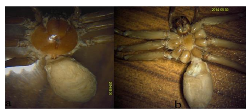
Figure 2. (a-b) Dorsal, and ventral, view of Eusparassus naheedae n.sp