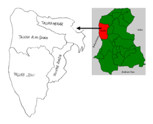
Figure 1.Site of investigation of spider of rice crop in District Dadu Sindh