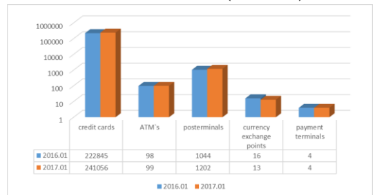
Graph 2. Modern services of the banks (number)

Most important leading services of the banks in NAR to promote international services are credit cards and the transactions related to these. Correspond to the increase of the number of credit cards, the services related to cards are also went up. The following graph summarizes the most useful information pertained to these issues.