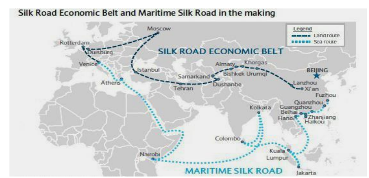
Map 1. New Silk Road Initiative's routes through Eurasia and Indian Ocean

Firstly, in the conditions of the XXI century, developing countries gradually strengthened as the main "drivers" of the world economy. Here we are talking about China, whose leaders still carry their own state to the developing countries, Russia, restoring its economic potential and on the other BRICS countries, which are the leaders of the economy in Asia, Latin America and Africa. While Western countries are mired in migration crisis and in the redistribution of spheres of influence in the world.