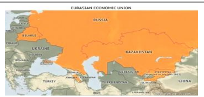
Map 2. Member States of the Eurasian Economic Union

Eurasian integration and the strengthening of its role in it, Moscow plans through the use of such multilateral mechanisms as the Eurasian Economic Union, SCO, CSTO, Union State of Russia and Belarus and a number of other organizations, where Russia plays a key role. In 2010, three of the five members of the Eurasian Economic Community (Belarus, Kazakhstan and Russia) founded the Customs Union , providing a common customs policy. With the introduction, it was announced the formation of a single economic space by of 17 basic agreements between those countries. The development of this space in 2014 in Astana signed an agreement on a more advanced form of integration - the Eurasian Economic Union (EAEC) which in 2015 joined Armenia and Kyrgyzstan.