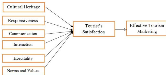
Figure 1: Conceptual Model for influencing tourist's satisfaction and effectiveness of tourism marketing in Sabah, Malaysia.

From the in-depth review of, six influential factors have been identified which consists of cultural heritage, local communities' responsiveness, communication, interaction, hospitality, norms and values. These factors have a more significant impact on tourist satisfaction which finally influences the effectiveness of tourism marketing. Based on the in-depth reviewed of literature a conceptual model has been put forward which is presented below: