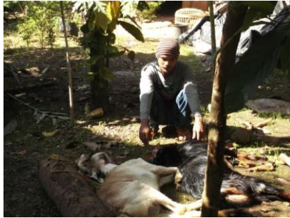
Figure 2. Goat's slaughtering

In the past, the elders tried to get rid of plague by holding some rituals. However, none of the rituals showed any recovery until they performed tasyakuran (appreciation to God) by cutting goat's head. They were cutting and burying the goat's head on crossroad during Suro in Kliwon as a form of appreciation to God. As the informant said that, "Suroan is held because Bangunharjo's people had been stricken by a disease, then they were performing tasyakuran by cutting a duck in order to get rid of the disease but it did not work until they were performing tasyakuran on Suro in Kliwon with cutting goat's head and burying in crossroad" (2/L/Ln/8/7/2019).