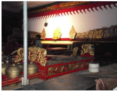
Figure 3. Puppet Performance in Bangunharjo's Hamlet

Puppet performance is always done as the closing event in Suroan tradition. The performance is started on night after riungan with accompaniment of Javanese songs and gamelan. Puppet is chosen as the closing performance because it is one of the cultures that often staged in Indonesian culture.