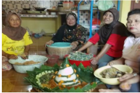
Figure 5. The women while cooking in Suroan tradition

begin by going to the market to buy cooking needs and the evening before the event in the morning the cooking activity starts until it is finished.