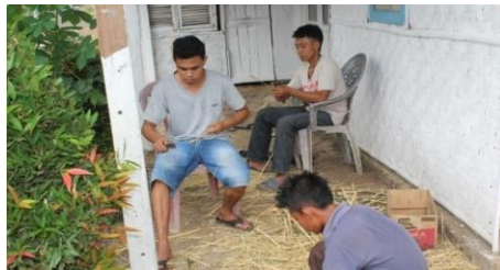
Figure 4. The society of Bangunharjo is helping each other in Suroan preparation

Besides material action, the society is also helping for the sake of Suroan successful. The society is helping start from pre-implementation including the making of stage, preparation, and cleaning the venue.