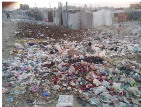
Fig. 4: Openly dumped solid wastes; affecting the poor people of the Quetta city.

In this study, it has been observed that the uncollected waste not only affects the environment of the city but also a major problem of unaware public of the Quetta city, that do not even treat the waste as waste [Fig 4].