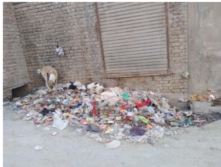
Fig. 1.1: Household waste thrown by people at the corner of street, near Gool Masjid Satellite town Quetta.

In Pakistan, due to insufficient budget, poor management and unhygienic disposal practices, it has been observed that the large volume of solid waste is dumped openly, everywhere around the cities (Fig. 1.1 & 1.2). Huge volume of solid waste at numerous places upkeep the growth of the pathogens and affects human health. The aim of this paper is to estimate the total waste generation in Quetta city at ward levels, and give suggestions for its effective management.