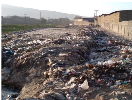
Fig. 1.2: Openly dumped solid waste in front of Barech Market Sirki road, Quetta.